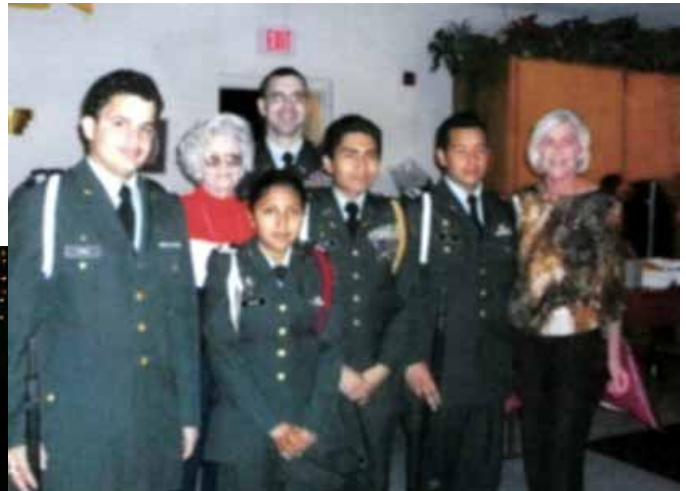
Camelback High School Jr. ROTC One of our Auxiliary Charities