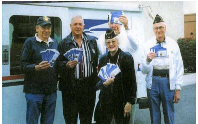
Phone Cards for Overseas Military