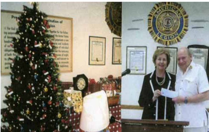
Auxiliary Christmas In July for their many charities