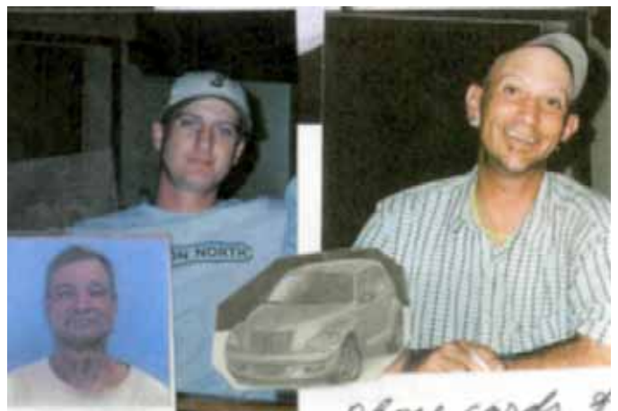
SAL - Car Wash for Charity