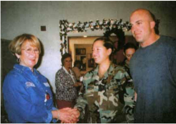
National Guard at Christmas Party