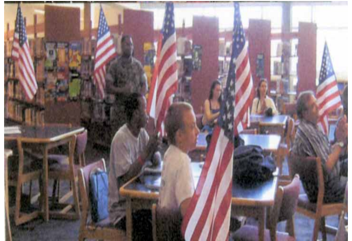
Flags Donated to School Classrooms