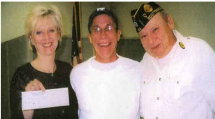
Check given for Military/Veterans Room at Airport